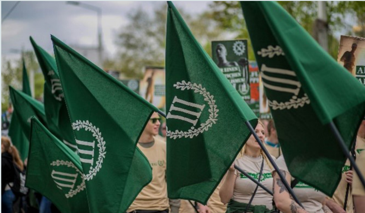
Members of “Der III. Weg”, a right-wing extremist small party. The majority of the members are classified as highly violent by the Office for the Protection of the Constitution

Contrary to Straßner and Pfahl-Traughber’s assessment, however, there were various incidents in 2019 including violent attacks by left-wing extremists on police officers, state and economy representatives, political opponents, and right-wing extremists. For example, there were two attempted murders on economic representatives and right-wing extremists. It is, therefore, clear that the level of violence of left-wing extremism and terrorism is rising with individuals increasingly targeted. Such violent incidents demonstrate a persistently high level of danger, both in terms of criminal and violent offences, as the chart aboveshow. Left-wing extremism still poses a major threat to public security in Germany, which is not reflected in the structures usually classified as terrorist organisations. 14