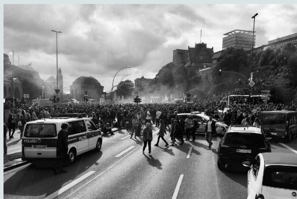
Disputes between police and demonstrators in the course of the G20 summit in Hamburg

The last year has seen multiple violent incidents during demonstrations against the COVID-19 restrictions, and the willingness to use violence is expected to increase. There is a particular cross-over with right-wing extremist attitudes that has led to observations by various Offices for the Protection of the Constitution of the German countries for some of these organisations, namely "Querdenken" and its regional offshoots. 20